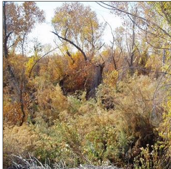
Border Security Clearing Project, 2006 - AFTER

The intent of the Limitrophe CMA is to unite the mandates, activities, and responsibilities of Border Security Clearing Project, 2006 - BEFORE