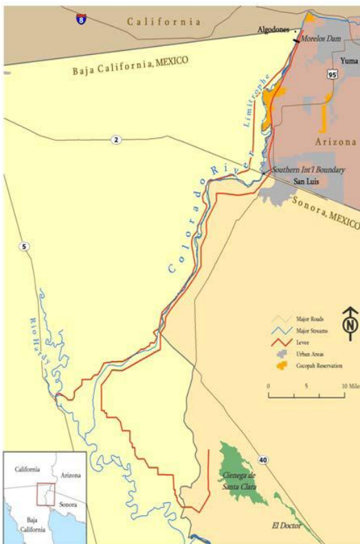
Arizona Riparian Council Newsletter January 2007

This riverine border has also suffered an invasion of illegal border crossing activity over the years, described by one U.S. Department of the Interior official in his 2008 testimony before